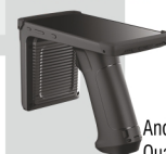
STA U TOUCH

Android 9.0 Qualcomm 8 core 1.8 Ghz, 4GB RAM 64 GB ROM