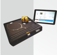
RFID SMART TREY

Audible Sound Alarm & Visible LED ISO: 18000-6B EPC G2 Reading Distance: 3 Mtr.