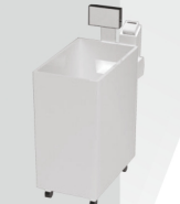
RFID SMART TROLLEY

Cortex™-A53 4-core1.3 GHz, 2GB & 16GB, AND-10, Wi-Fi, BT, 4G, HDMI, USB Host, Screen 10.1 Inch