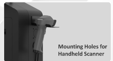
Mounting Holes for Handheld Scanner