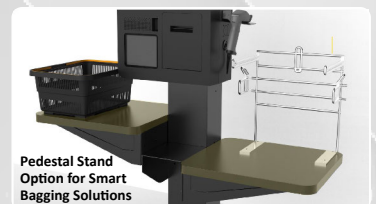
Pedestal Stand Option for Smart Bagging Solutions