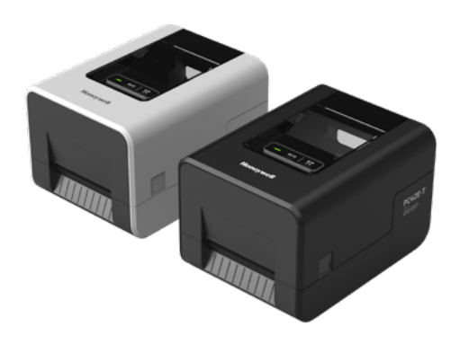
PC42E-T offers 203/300 dpi print resolution with up to 6 ips speed and modular design to help meet the demand for productivity increase and cost saving.

Connectivity options for the PC42E-T are diverse, catering to different usage scenarios. In addition to built-in ethernet and USB host, the printer supports a host of accessories like cutters, peelers, Wi-Fi/Bluetooth®, and USB to serial cable. The cutter supports enhanced productivity, while the peeler supports various paper types and offers excellent stripping performance. The optional Wi-Fi/Bluetooth module enables easy deployment and management of a large number of printers, reducing the limitations of physical cable connections.